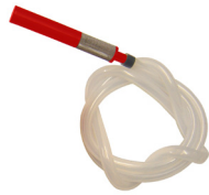
RED FLOAT 9 – 11 gallons

Widge Floats are available in 3 pre-cut and colour coded options: