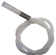
CLEAR FLOAT up to 36 gallons (Self Cut)