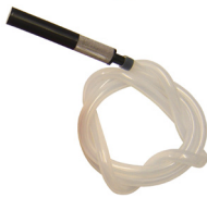
BLACK FLOAT 18 – 22 gallons